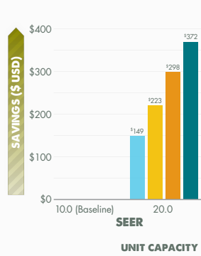
ANNUAL ENERGY COST SAVINGS FOR COOLING 10-SEER BASELINE*